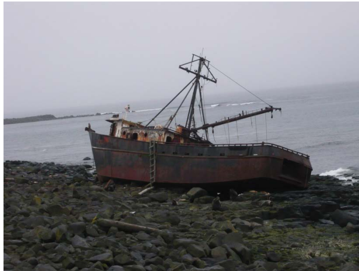
Figure 1 F/V OCEAN CLIPPER (June 2009)

The F/V OCEAN CLIPPER ran aground on March 18, 1987. As early as May 15, 1987 fur seals were observed around the grounded vessel. Access to the vessel is limited and difficult. Via land, the vessel is ¼ mile from a primitive road. The terrain between the road and the vessel is rugged with an approximate 100 ft change in altitude. Via water, the vessel is isolated by a reef and shallow draft vessel access is more than 1,500 ft away.