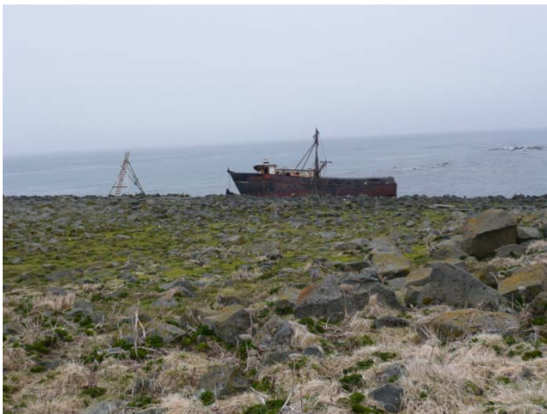
Figure 2 F/V OCEAN CLIPPER (June 2009)